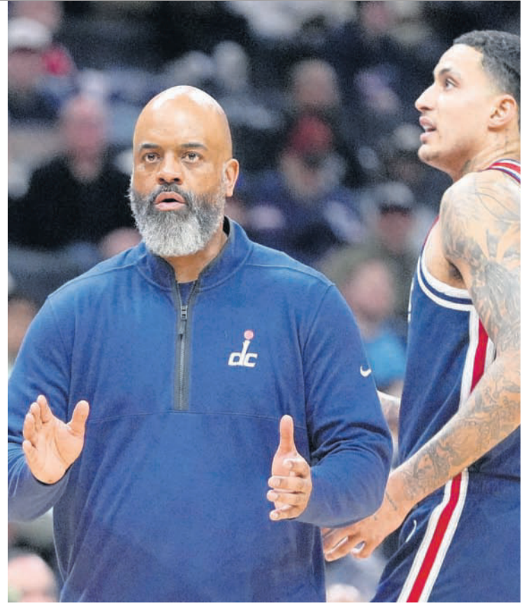
Washington Wizards coach Wes Unseld Jr. talks to the team during a timeout in the first half of an NBA basketball game against the San Antonio Spurs on Saturday, Jan. 20, 2024, in Washington.

Gender segregation in public places has also been eased, with men and women attending movie screenings, concerts and even raves — something unthinkable just a few years ago. □